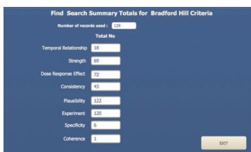
Figure 2 Summary of Bradford Hill Indices for Epidemiological studies for UHF studies