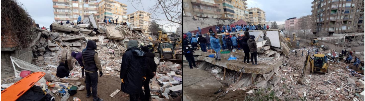
Figure 1. Scenes of damage from the February 6, 2023 earthquake in Turkey.