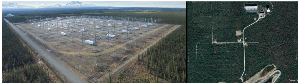
Figure 2. Left: High Frequency Active Auroral Research Program (HAARP) facility in Gakona, Alaska (USA). Right: Norwegian Tromsø ionosphere heating facility.

Figure 2 (left) shows the HAARP ionospheric heater in Gakona, Alaska (USA). Its 180 units are capable of producing a total radiated power level of 3.6 MW with an effected radiated power of approximately 575 MW [36, 41]. Figure 2 (right) shows one of the other ionosphere heaters, this one in Tromsø, Norway, with an effective radiated power of 300 MW [29, 31, 42] which, like HAARP, is capable of triggering earthquakes [38-40].