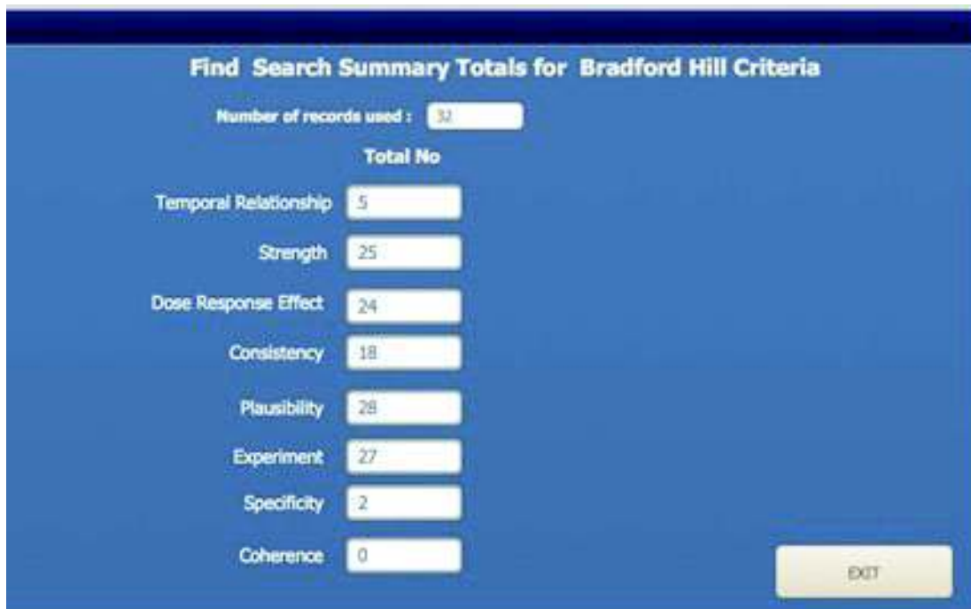
Figure 9 Summary Totals for Epidemiology studies reviewing Brain Cancer using the Bradford Hill Criteria